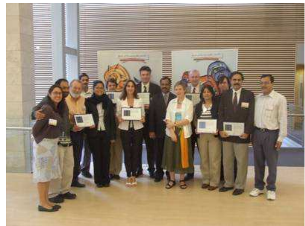
President CMAO at the ICLEI World Congress

The conference gave an opportunity to the City Managers Association Orissa to interact with the international