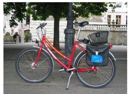
City of Geneva bicycle for employees

Cities in Europe and Africa were recently recognized by ICLEI – Local Governments for Sustainability for their excellence in successfully promoting and supporting the use of non-motorized vehicles as part of their urban