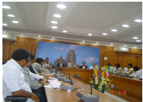
CMAO Annual General Body Meeting in Progress

The Patron CMAO and Principal Secretary H&UD Department in his opening remarks congratulated all members being part of this movement. He advised all to feel CMAO as ours and it is meant for the professional development of city managers of Orissa. This is an excellent organization for the capacity building and professional development related programmes and Govt. is keen to support its activities, said the Patron.