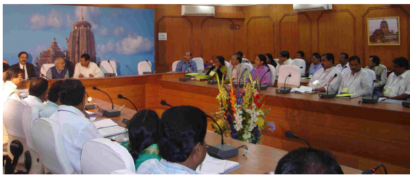
Municipal Resource Mobilisation Workshop in Progress

In the technical session, three presentations were made by the resource persons. The first presentation included Draft Revenue Enhancement Action Plan (REAP) prepared by CMAO for the workshop. The REAP includes best practices in Municipal Resource Mobilization practiced at national and international cities. The last two presentations include one on National perspective and one on Resource Mobilization in Indore Municipal Corporation.