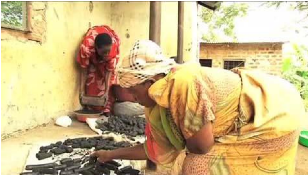
Rakai women drying charcoal briquettes.

countries, regional networking, and cooperation in protecting and managing a shared resource – Lake Victoria. The project that ended in 2012 has seen a total of 450,000 people benefit; 230,000 people have access to safe drinking water and 220,000 people have access to decent sanitation facilities. The successful implementation of Lake Victoria Region Water and Sanitation Initiative has led to an upscale of the same initiative - Lake Victoria Water and Sanitation Phase II now covering five countries- Kenya, Uganda, Tanzania, Rwanda and Burundi. Some of the beneficiaries give their stories: