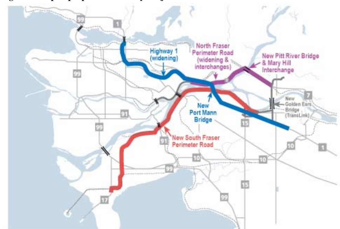
Figure 5. Map of proposed "Gateway Project"