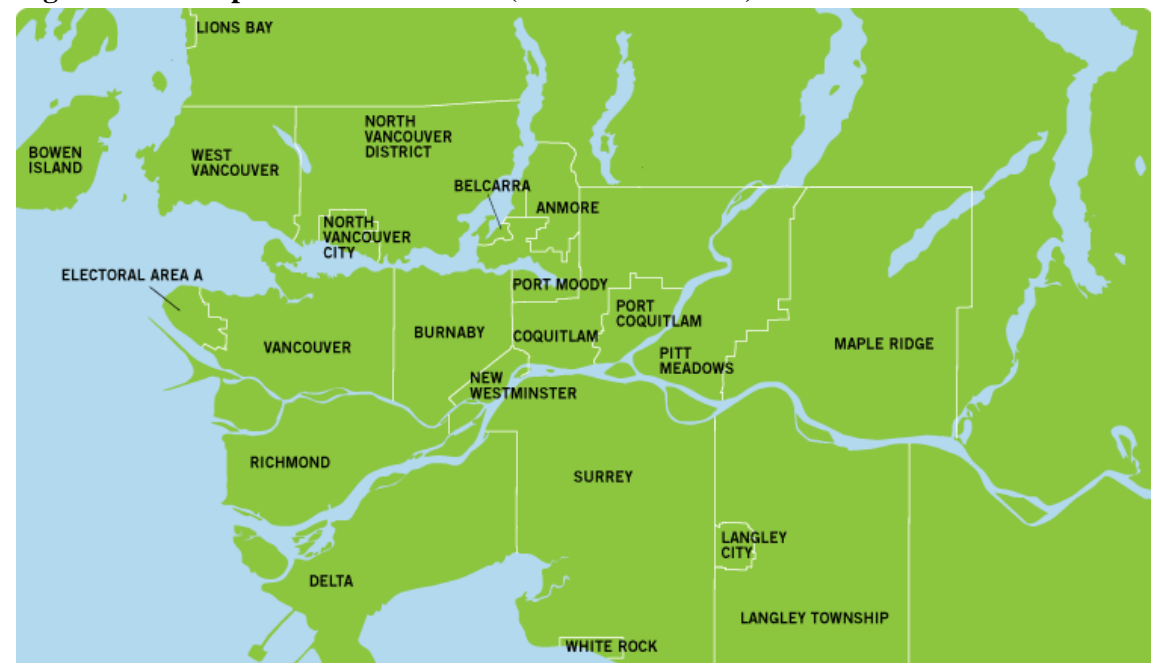
Figure 2. Municipalities of the GVRD (Metro Vancouver)