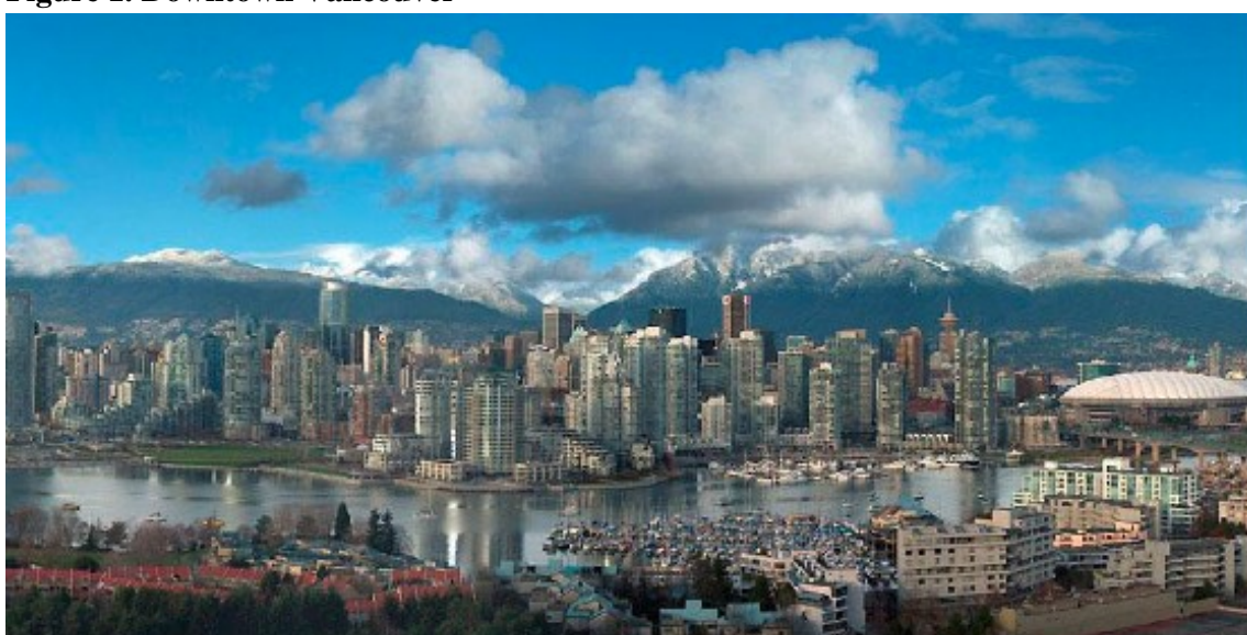
Figure 1. Downtown Vancouver

Vancouver appears "at or close to the top of nearly every international list of the best places to live" (Harcourt et al, 2007: 1). While its verdant coastal mountain setting contributes to its appeal, Vancouver's innovative approach to public planning has been acknowledged in making it the "poster child of North American urbanism" (Berlowitz, 2005). The term "Vancouverism" has even entered the lexicon of urban professionals describing a philosophy and approach to planning characterized by "multiple-use, high density core areas; a transit-focused and auto-restrained transportation system; exquisite urban design to echo a spectacular natural setting; and peaceful, multicultural population" (Harcourt et al, 2007: 1). Its collaborative approach to urban development involving extensive public and stakeholder engagement has been recognized through a variety of awards and distinctions. Indeed, Vancouver was the host of the first United Nations Conference on Human Settlements in 1976, where its cutting edge participatory planning model was showcased to the world (Timmer and Seymoar, 2005).