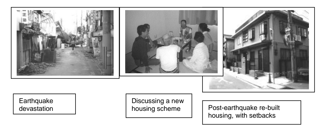
Source: summaries of newsletters issued by the Mano Machizukuri Promotion Committee between 1995 and 1996. The Newsletter series was called: 'Mano-ke Ganbare' (Cheer-up Mannoko!).