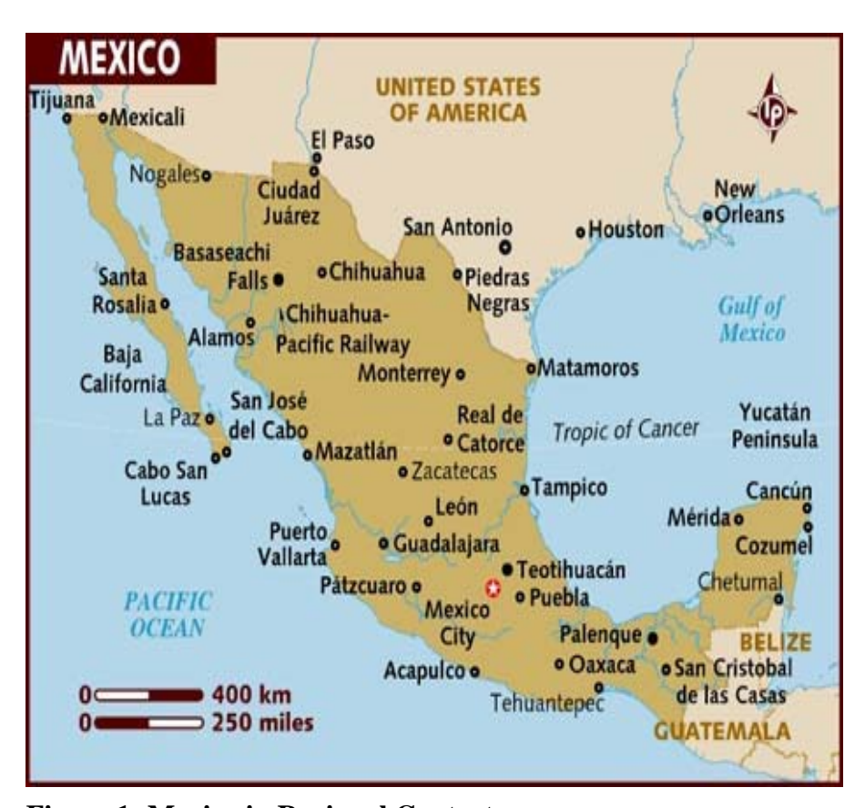
Figure 1: Mexico in Regional Context

The report is organized as follows. The next section provides background information on the Mexico City Metro-Area, the target organizations and their geo-administrative areas of jurisdiction. Next, it describes the institutional framework for participatory urban planning in Mexico City. A subsequent section chronicles some of the major accomplishments of the target organizations. Finally the report identifies and discusses the factors that have contributed to the CBOs' success and as well as lessons that can be gleaned from the case-study.