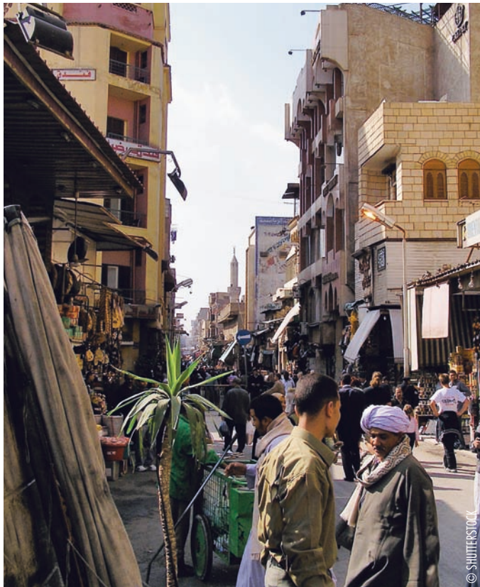
▲ A market street in Cairo, Egypt.

UN-HABITAT projects fall under various programmes, which are the platforms on which the agency bases its work. Programmes are designed to help policymakers and local communities find durable solutions to urban human settlement challenges. Programmes operate globally, regionally, and nationally and have huge potential for improving the lives of millions of urban poor. Therefore, programmes represent the agency's core activities, for which increased and sustained funding is required.