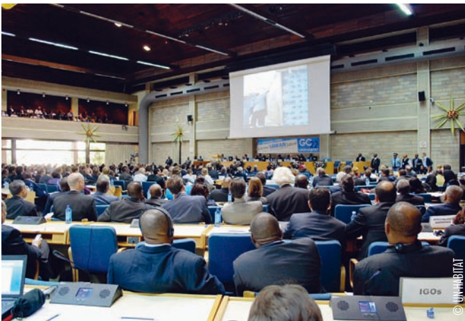
▲ Delegates at the 22 nd session of the Governing Council in Nairobi, Kenya.

The Governing Council meets every 2 years and is composed of 58 member states, which represent 5 regional groups.