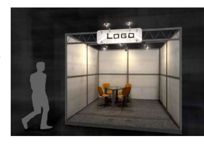
Standard booth, 9 square meter shell scheme stand.

Larger booths can be constructed by combining a number of standard booths. When combining several booths, you may request the panel between two adjoining stands to be removed to make a larger booth. For the corner booth, the side panel can be taken out if needed. Requests to remove panels have to be made explicitly to the exhibition management.