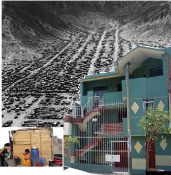
Lima, Peru: From squatter shack to elegance. Extensive squatter invasions in Peru starting in the 60s, are now incorporated as citizens.