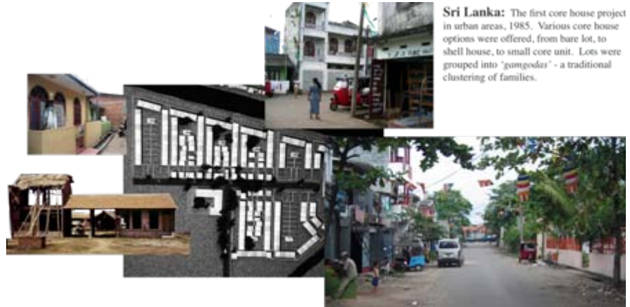
Sri Lanka: The first core house project in urban areas, 1985. Various core house options were offered, from bare lot, to shell house, to small core unit. Lots were grouped into 'gamgodas' - a traditional clustering of families.