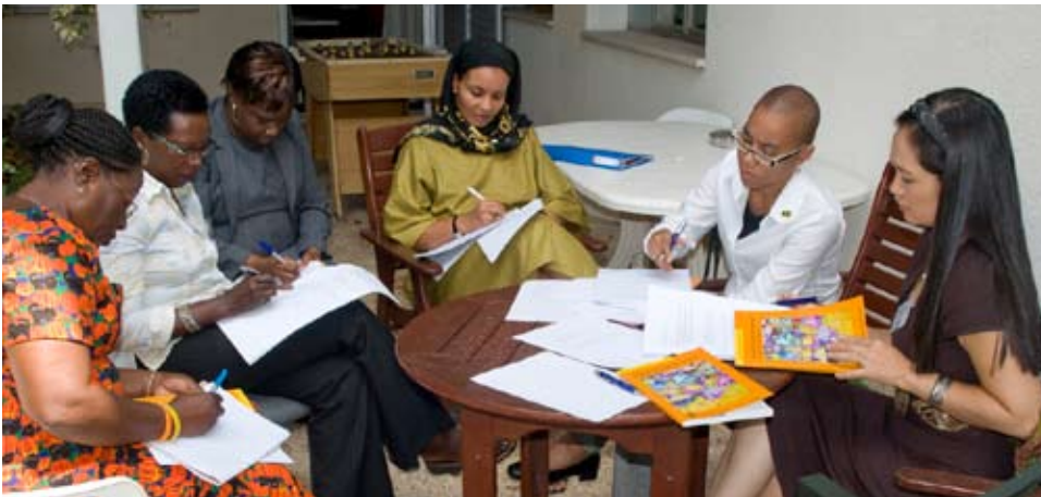
Working Groups during 2009 Training Course