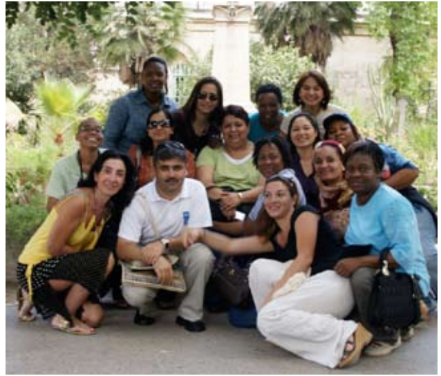
Excursion to Jerusalem during 2009 Training Course