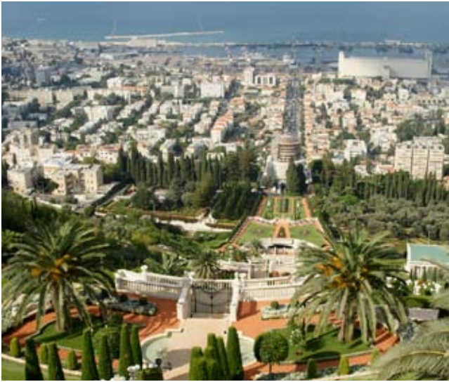
View over Haifa and Bahai Gardens (within walking distance from MCTC)