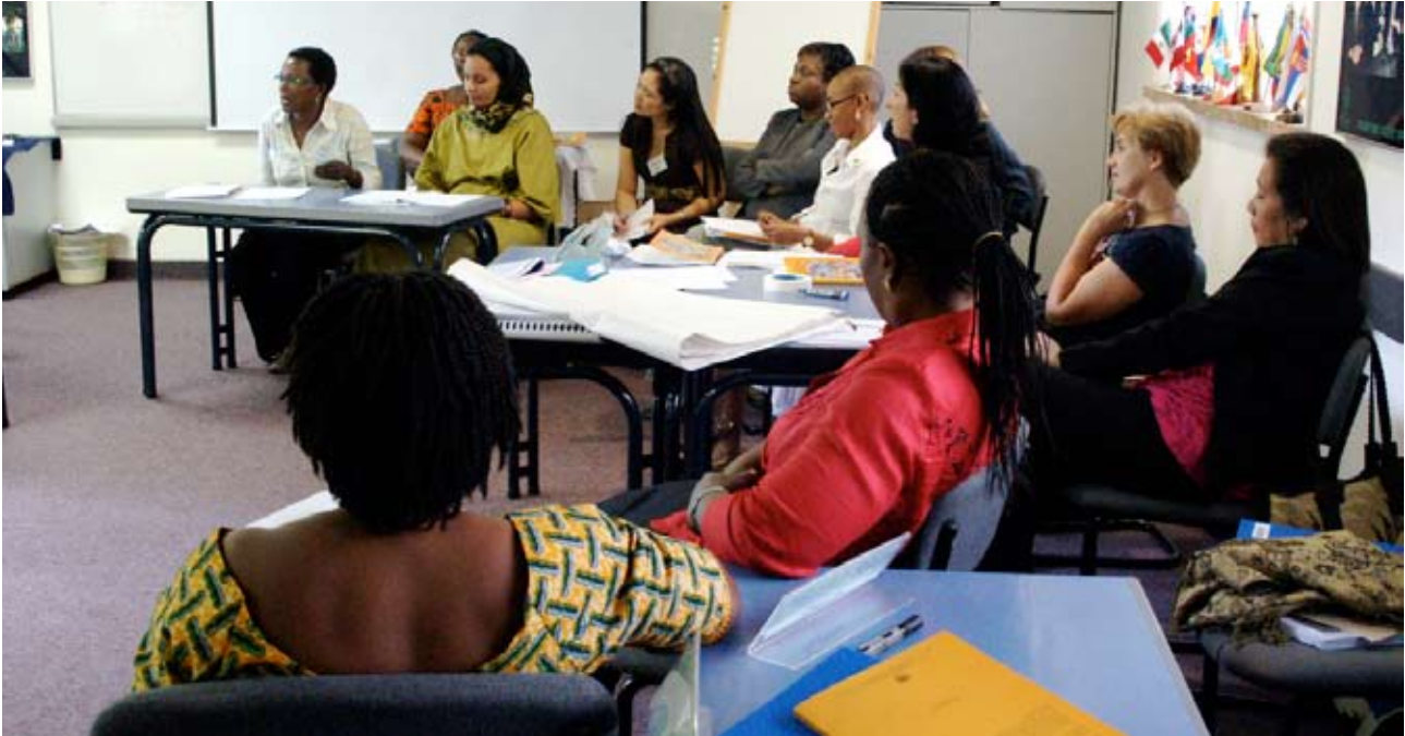
Role Play, council debate on gender issues during 2009 Training Course

TRAINING COURSE FOR LOCAL GOVERNMENT TRAINERS HAIFA, 28.11-12.12. 2010