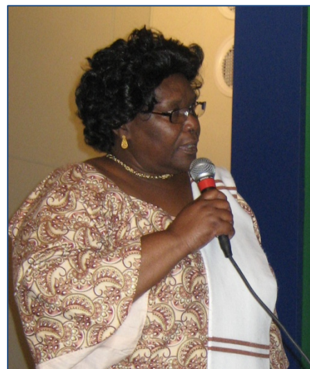
A participant poses a question to the panel.