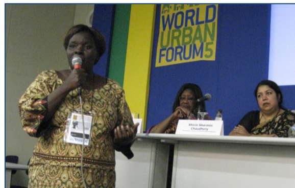
Open floor discussions on Dialogue 3: Economic Empowerment of Women in Cities

In discussing women's economic empowerment, dialogue panellists and participants highlighted a need to adopt a holistic approach to gender issues. They emphasized a need to institutionalize gender awareness across all government departments and that focusing on only one department alone would not be sufficient. They also spoke of the need to involve grassroots groups in targeted government interventions on improving the economic status and participation of women in cities.