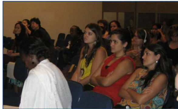
Participants in the Gender Equality Action Assembly

After the three presentations on emerging issues on Gender and Sustainable Urbanization were completed, an open and participatory session enabled participants to ask questions and seek clarification from the panellists, while also sharing their own experiences. Emerging issues included the following: