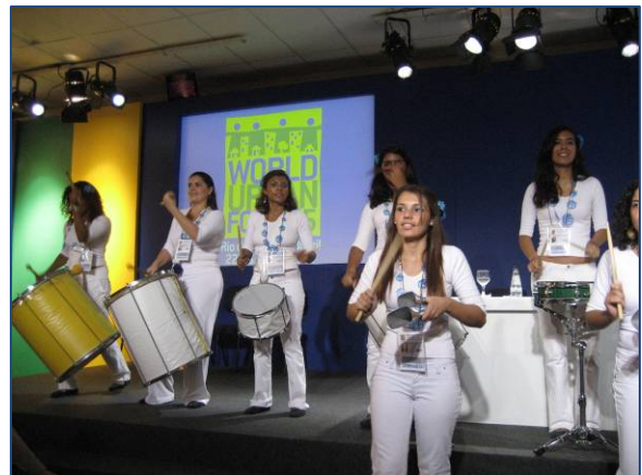
All photos in this report ©UN-HABITAT unless stated otherwise