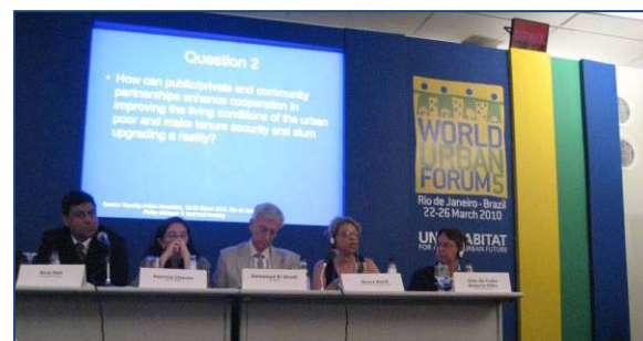
Panelists discussed and debated a set of fixed questions during the policy dialogue.

He also said that partnerships are valuable, but the processes can be difficult and time consuming. He pointed out that academics can contribute through analysis by showing how issues relate to one another. In addressing a question about laws, cultures and traditions that impede women's access to land, he said that discrimination is also related to religion, but land administration programmes can also find ways to improve the position of women by building on specific elements of the religion. He mentioned opportunities to achieve this in Muslim societies.