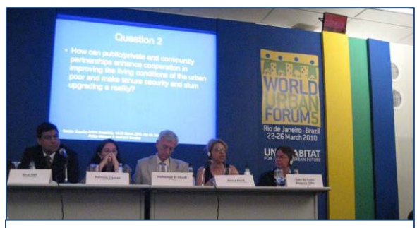
Panelists discussed and debated a set of fixed questions during the policy dialogue.

He also said that partnerships are valuable, but the processes can be difficult and time consuming. He pointed out that academics can contribute through analysis by showing how issues relate to one another. In addressing a question about laws, cultures and traditions that impede women's access to land, he said that discrimination is also related to religion, but land administration programmes can also find ways to improve the position of women by building on specific elements of the religion. He mentioned opportunities to achieve this in Muslim societies.