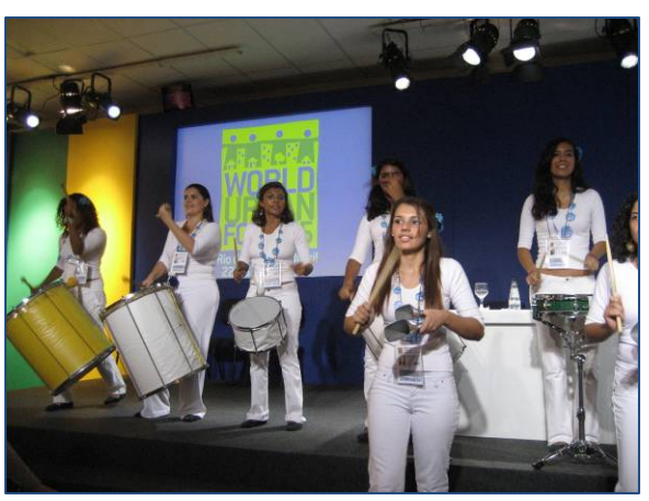
All photos in this report @UN-HABITAT unless stated otherwise