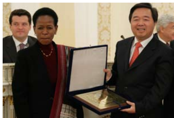
Yangzhou Municipal People's Government in China's Jiangsu Province is presented with the Habitat Scroll of Honour.

Xiamen Municipal People's Government, China Centre for Development Communication (CDC), India