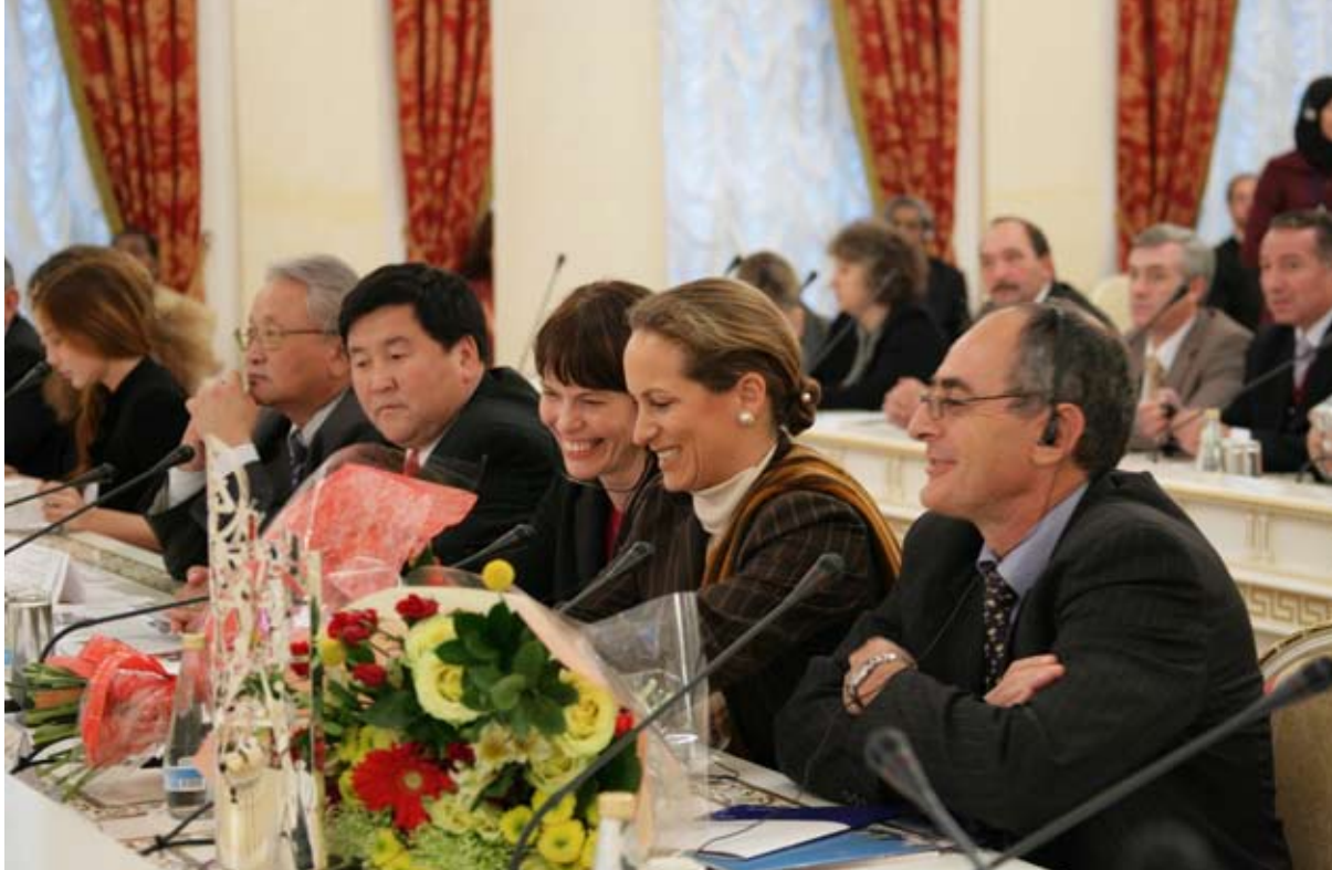
Princess Zahra Aga Khan at the 2006 World Habitat Day celebrations in Kazan, Russia.