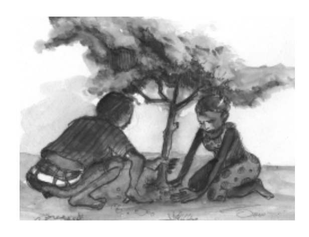
Nairobi, Kenya

With their exposure to the extremes of violence often reported, child soldiers are likely to suffer very serious physical, psychological and sexual harm. Overcoming the effects of those experiences, as well as dislocation from families and communities of origin, and loss of traditional education and socialization, and integrating back into the community, presents huge challenges. Governments who fail to acknowledge the participation of children as fighters, and exclude them from benefits have not always recognized their needs. Many other children and youth have also been affected by the impact of war on their families and communities, and the destruction and dislocation which has resulted.