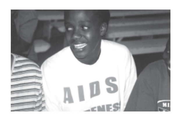
Nairobi, Kenya: © UN-HABITAT

UNICEF 2002 Young People and HIV/AIDS: Opportunity in Crisis