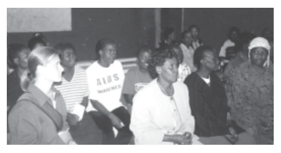
Nairobi, Kenya: © UN-HABITAT

Adolescent girls are at the very highest risk of getting infected. The pattern is especially clear in Sub Saharan Africa.... The danger of infection is highest among the poorest and least powerful. UNICEF (2002) Young People and HIV/AIDS