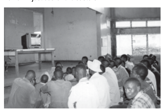
Nairobi, Kenya: © UN-HABITAT

The situation of youth at risk in Africa is acute. While youth in many parts of the world, especially in developing countries, are confronted with severe problems, it is clear that African youth are especially vulnerable. Cities in Africa include some of the world's poorest and most overcrowded urban environments. The lives of young people in Sub Saharan Africa, in particular, are marked by a combination of severe human injustices and disasters.