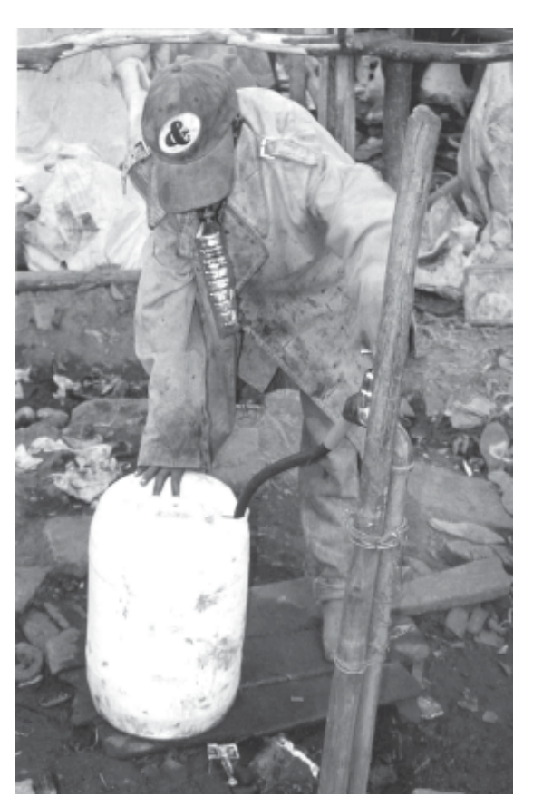
Nairobi, Kenya: © Justo/ UN-HABITAT

of a formal education.<sup>41</sup> Child labour also increases the risks of exposure to illegal activities such as prostitution or drug trafficking, and increases the risk of AIDS especially among girls. Finally, close family ties are essential for children, but child labour often inhibits regular contact with family members, because of distances and transport costs. Coupled with exploitative working conditions, these problems can transform child workers into street children.