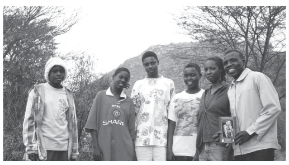
Nairobi, Kenya: © UN-HABITAT

This section has outlined the challenges facing youth in African cities. The specific case of youth at risk is discussed in the next section.