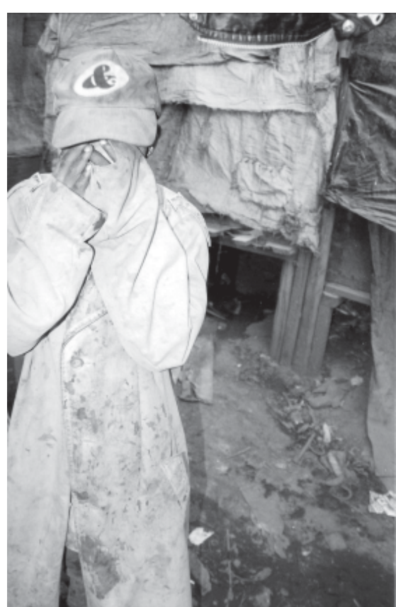
Nairobi, Kenya: © Justo/ UN-HABITAT

aged 15 to 24.<sup>47</sup> Every day, about 1,700 children become infected with HIV. There are an estimated 2.1 million children worldwide under age 15 currently living with HIV. In 2003, about 630,000 children under the age of 15 became infected.<sup>48</sup> About 1.7 million new