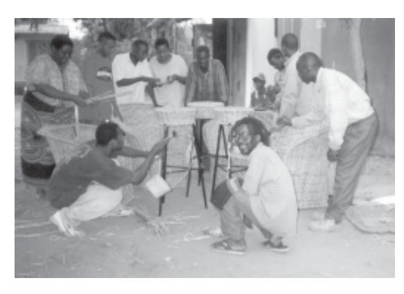
Dar es Salaam, Tanzania: © UN-HABITAT

behaviour. The police and the courts are two facets of the criminal justice system which can play a major role in reducing the marginalisation of youth at risk, as well as in their rehabilitation. <sup>121</sup> A corrupt or inefficient police and justice system encourages calls for tough responses and vigilante justice, and affects the extent to which youth at risk trust state institutions, and can be expected to abide by laws and policies.