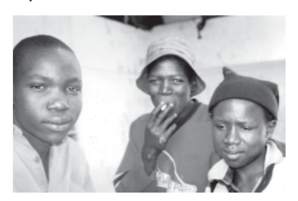
Nairobi, Kenya

Internationally, a number of terms are used to refer to young people. The term youth is often defined as those between the ages of 15 and 24, young people those of 10-24, adolescents 10-19 year-olds, and children, those under 10.6 Countries and regions have many different conventions. In Africa, it is common to define young people as those up to 35 years of age, and to include those under 10. In general, follows the international conventions where data exists, and uses some of these terms interchangeably. It focuses mainly on youth of 15-24.