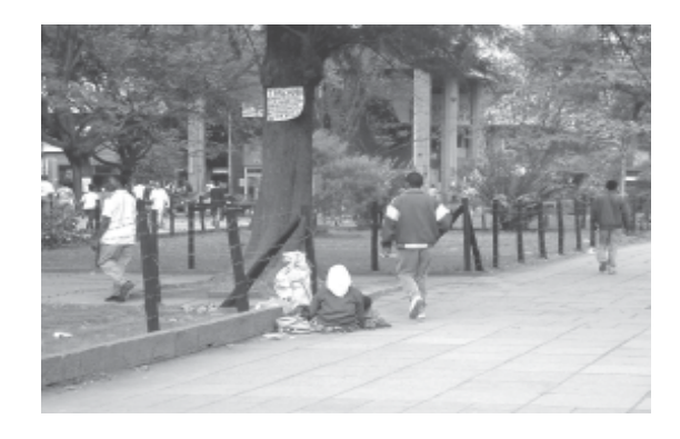
Nairobi, Kenya: © Jimmy Shamoon/UN-HABITAT

In such settings there is a thin line between what is legal and what is illegal. It is in this precarious environment that the majority of African youths are socialised, and many do not have a family member with a contract or steady salary in the last two generations. Poverty similarly limits access to education, and impacts the health of children and young people. Poverty has always been associated with forms of social exclusion — exclusion from the benefits of good services and quality of life, from access to power and decision-making - but the huge increases in the numbers of urban poor mean that far higher proportions of urban youth are now subject to such social exclusion.