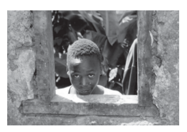
Nairobi, Kenya: © Justo/UN-HABITAT

The behaviour of young people in many African cities often fluctuates between survival strategies and risk taking. The Street children - those with disrupted or no family ties, who survive in urban areas on the streets form the most tragic and extreme examples of social exclusion, and risky behaviour. They are one of the fastest growing problems in Africa (as well as other