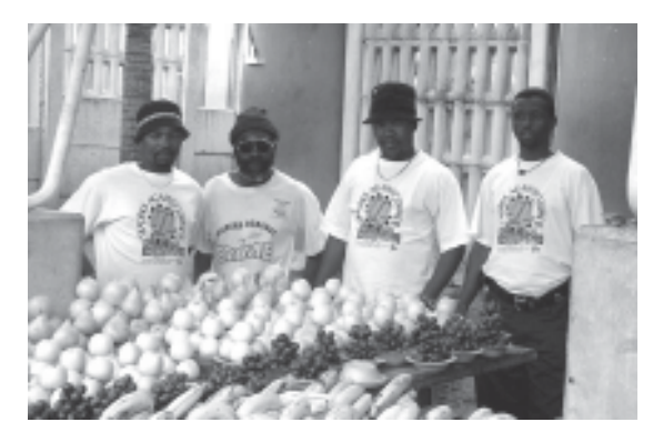
Durban, South africa: © Ismail/UN-HABITAT

A community safety diagnosis helps to identify the locations, neighbourhoods, groups and individuals involved in or affected by specific problems. This can include the use of surveys of victimization and needs, and surveys carried out by youth themselves. The partnership also needs to be involved in the development of a plan of action for tackling the problems identified and deciding on the priorities for action. Each priority action may involve a different set of partners. A substance abuse prevention project may include health officials, drug counsellors, teachers, police, prosecutors, judges, and community organizations specializing in drug rehabilitation, for example, and a programme to address school violence in schools, education administrators, teachers, parent associations, student organizations, social mediators, the police and local businesses. For every problem there will be an appropriate partnership, and the permanent support team helps to guide and coordinate partnership activity. Implementation of the action plan needs to be regularly monitored and evaluated to ensure that the goals and objectives of the plan are being met.