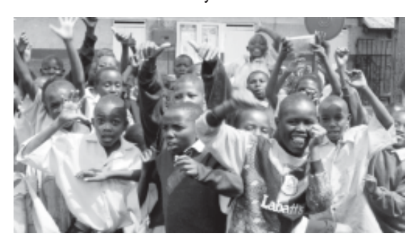
Nairobi, Kenya: © Sabine/UN-HABITAT

Many of those living in informal settlements do not even enter primary education, because families cannot afford it, or lack of schools. Others never progress beyond primary level, again for reasons of cost as well as the availability of secondary education. Yet others leave school early, under pressure from families to earn money or provide family care. This increases their vulnerability to crime and victimization, and further reduces their opportunities to find productive work and involvement in their society.