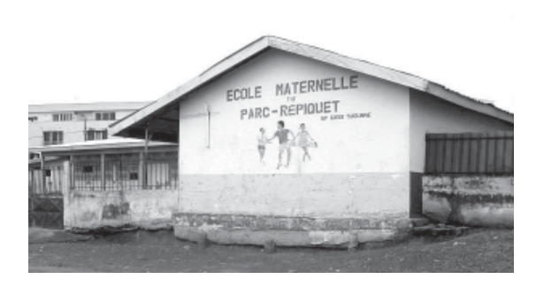
Yaounde, Cameroon: © Laura/UN-HABITAT

day.<sup>28</sup> The main causes of death and stunted growth are malnutrition and disease, both very prevalent in Africa. In Accra, for example, the majority of those under 15 years die from infectious and parasitic diseases. In Egypt, 25% of those under five years have stunted growth, compared to two percent in the USA. Child malnutrition is rapidly shifting from rural to urban areas.<sup>29</sup> The physical hazards for children and youth living in overcrowded slum areas are also high. In Ibadan, Nigeria 1,236 injuries involving 436 children were recorded over a three-month period, and less than 1% were treated in formal health facilities. In Kaduna Nigeria, 92% of children examined had blood lead levels above acceptable limits.<sup>30</sup>