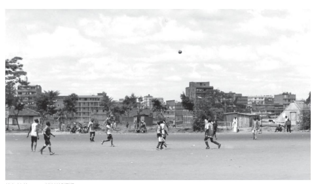
Nairobi, Kenya: © UN-HABITAT

This section has outlined the ways in which local governments in a number of countries in Africa have begun to meet the challenges of urban youth at risk, have been successful in working in a strategic way, and developing integrated comprehensive partnerships across municipal institutions and with civil society. The following section looks at the role of the international community.