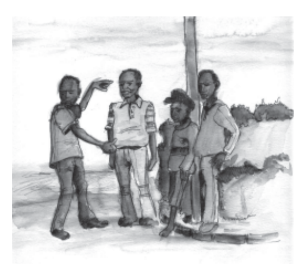
Nairobi, Kenya: © Kanyua/UN-HABITAT

Gangs and groups of young people engaging in delinquent or criminal behaviour are found in most countries. The great majority are male, and in most cases they are in a transition stage. Their formation is often a reaction to exclusion and marginalization in society, and they serve to provide alternative legitimacy and support. They offer acceptance, status, identity and social and recreational opportunities, as well as economic gain. They range from lose social or friendship groups - youths who hangout together - to more organized and structured gangs engaging in unlawful acts such as 'taxing', fighting rival groups, drug dealing or violent crime and intimidation. The latter often have a common style of dress, codes of conduct and language. Gangs of street children, on the other hand, are rather different, since their primary aim is survival, not crime.