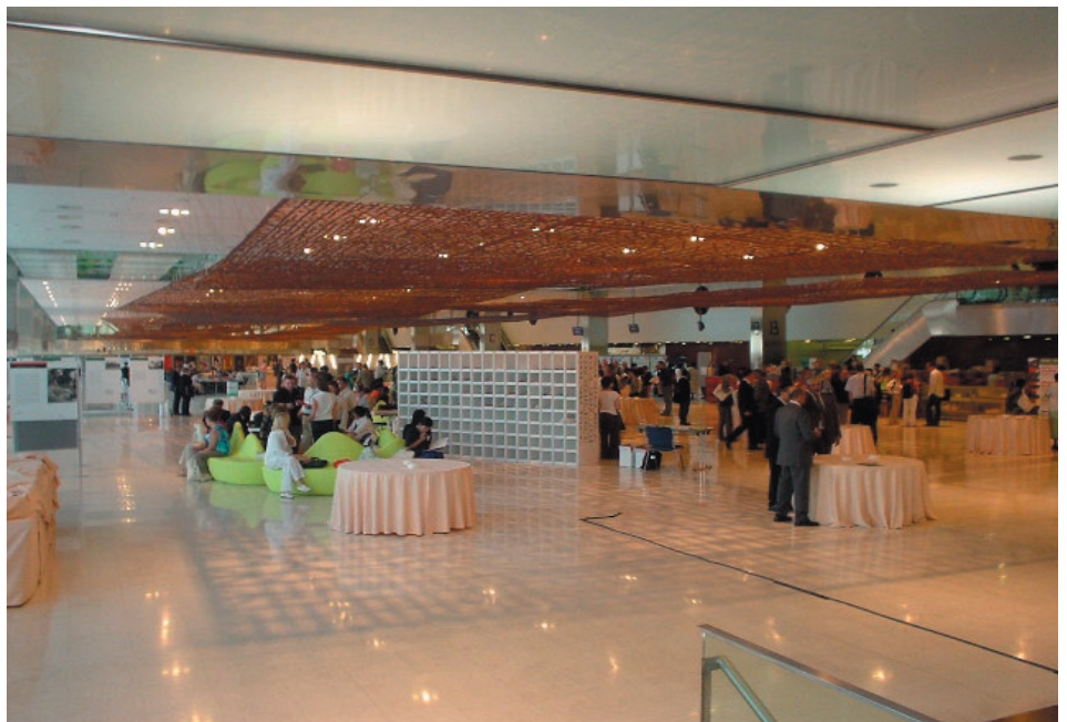
World Urban Forum delegates in the Convention Center.