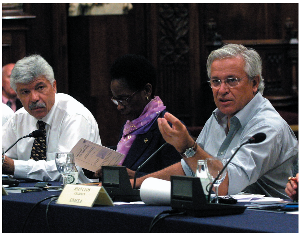
Mayor Joan Clos of barcelona addressing delegates.