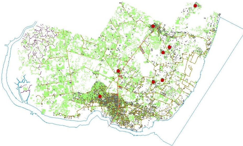
MAP OF MTWAPA TOWN SHOWING THE INFORMAL SETTLEMENTS