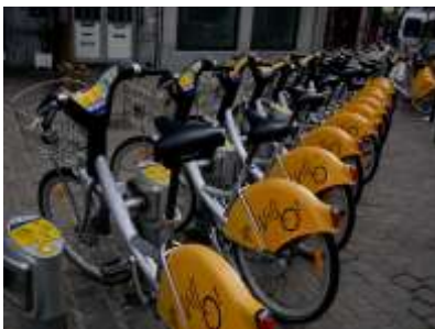
Villo!, the public bike scheme in Brussels

Bike sharing systems: From policy to infrastructure, from operating systems to business models, you will learn and discuss the most relevant issues to take into consideration when developing a bike sharing system.