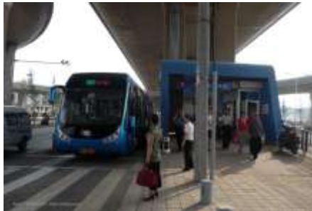
BRT station in Jinan, China.

We are living on a planet under stress. The dominance of the car in cities is one of the key factors that accounts for this global challenge. While citizens have a plethora of sustainable mobility solutions available to them, EcoMobility is still not