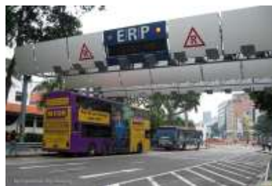
Road charging portal in Singapore.

EcoMobility innovation: Urban transport is facing a tremendous development in terms of technology (e.g., e-mobility, intelligent transportation systems) and services (car sharing, integrated ticketing, etc.) that can support EcoMobility. This session stream will enable you get in touch with the latest EcoMobility innovations.