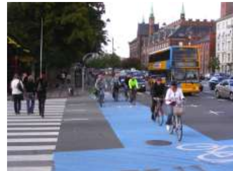
Bikeway in Copenhagen.

can our cities find themselves increasingly in the center of conflicting interests and needs. We urgently need to create an EcoMobility culture to restore livability of our cities, democratize mobility, and help to mitigate climate change.