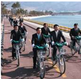
Wansu-Park, Mayor of Changwon, leading a bike ride