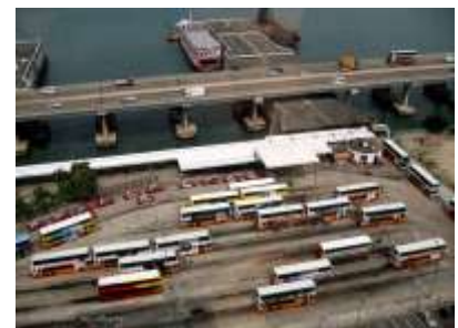
Bus terminal in Hong Kong.

Overcoming barriers: Widespread delivery of EcoMobility requires a number of barriers to be overcome. These barriers are not only physical (e.g., the quality of the interchange between different modes) but also institutional and financial. This stream will address such challenges.