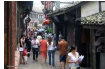
Historical street in Chongqing.

EcoMobility Changwon 2011 will provide you with fresh, visionary and enriching perspectives on sustainable urban mobility. Renowned transportation experts from around the globe will present some of the world's best case studies, and participants will learn how to kick start and implement good policies while engaging in fruitful debates about mobility for the future of sustainable cities.