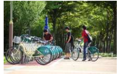
The NUBIJA bike sharing system in Changwon, Republic of Korea

During City Challenges Workshops , cities will be able to obtain immediate and in-depth feedback on how to solve specific EcoMobility challenges and problems they face. For participants, it will be an opportunity to engage in detailed discussions and to exchange knowledge applicable to real situations.